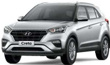
2020 Hyundai Creta